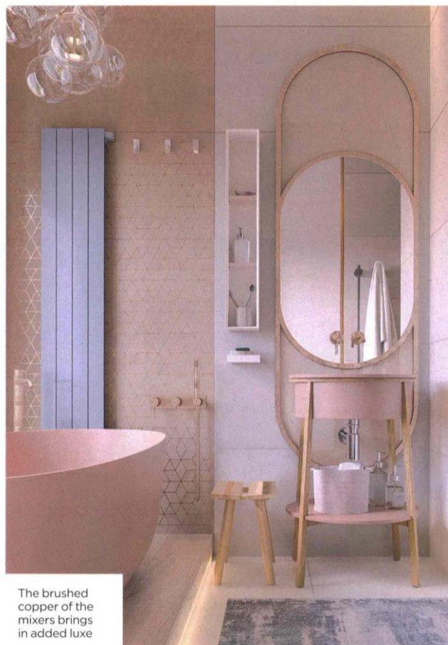
The brushed copper of the mixers brings in added luxe

Recessed lighting introduces a gentle glow, helping to create a soft ambience